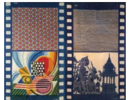
Transition Film Batik 140 x 90 x 2pcs 1979