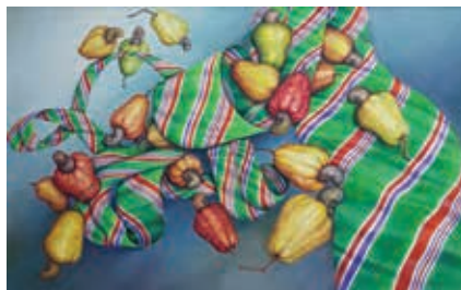
Interplay Oil on canvas 86 x 138 cm 1997