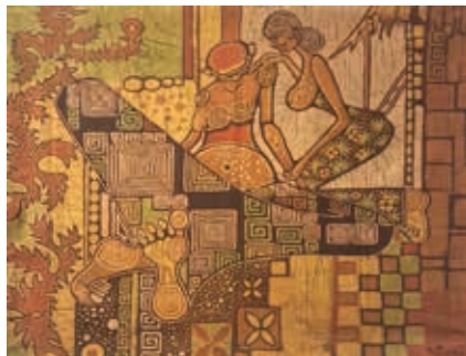
Wake Up My Dear Batik 90 x 107 cm 1968