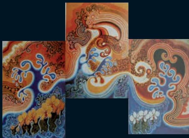
Stimulating Batik 122 x 174 cm 1986