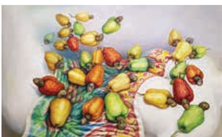
Exotic Dream Oil on canvas 86 x 138 cm 1998