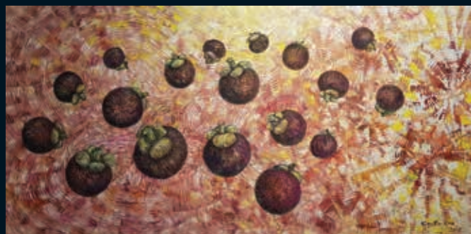
In Graceful Motion Oil on canvas 75x150 cm 2018