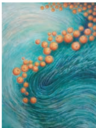
Stroke of Luck Oil on canvas 122.5 x 92.5 cm 2019