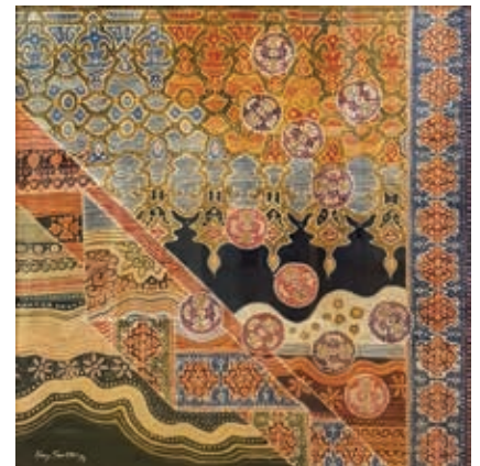
Three Folds Batik 86 x 86 cm 1996