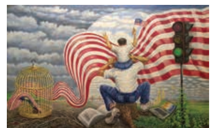
Positive Vision is the Way to Success Oil on canvas 86 x 138 cm 2007