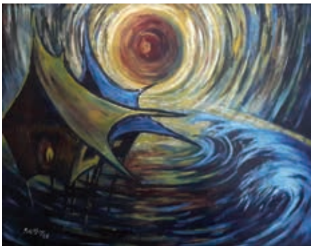
Storm Oil on canvas 90 x 107 cm 1965